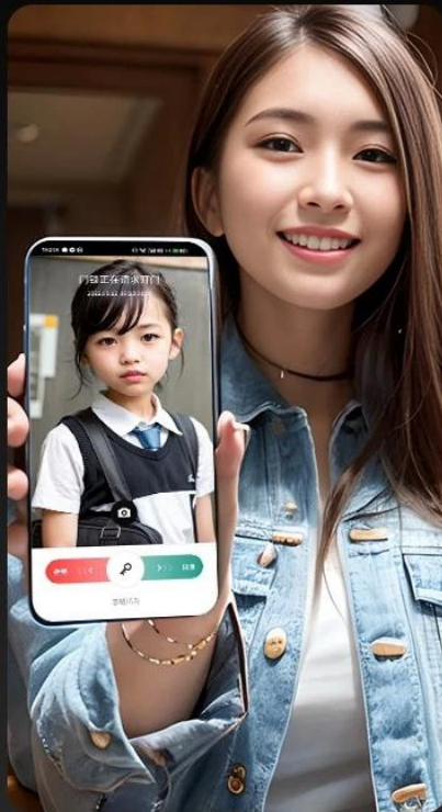
phones can see visitors