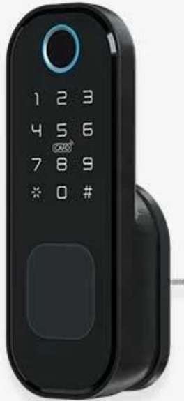
Security door lock