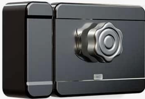
Wooden door lock