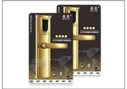
Two Open Door Cards