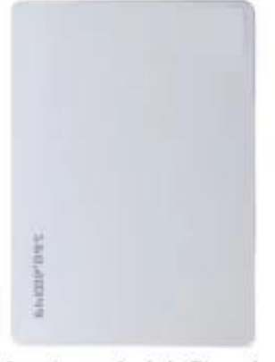
Master Add Card