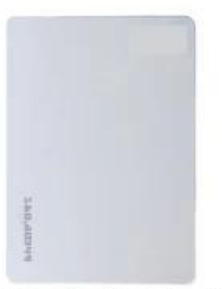
Master Delete Card