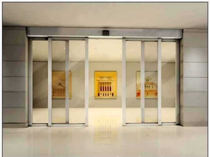
Induction auto doors