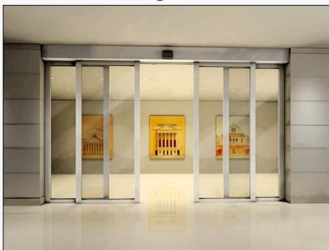
Induction auto doors