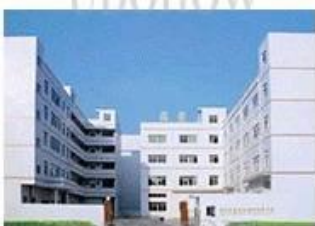
Time Attendance Factory