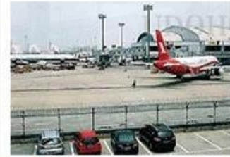
Standalone Access Control Airport