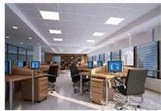
Time Attendance Office

Access control management software also includes all-in-one-card management system such as normal shift and multi-shifts time attendance management system; fixed ration dining management system; meeting attendance management system.