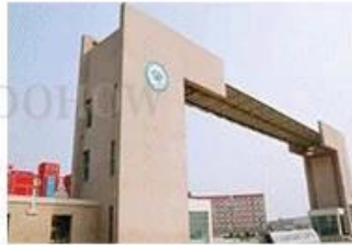
Networked Security School