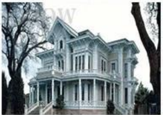
Standalone Access Control House