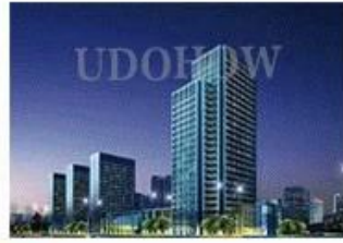
Networked Security School