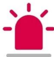
Intelligent Alarm Status