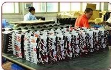
▲ Workshop Assembly