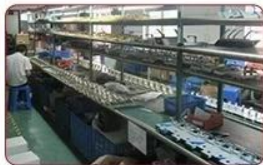
▲ Workshop Assembly