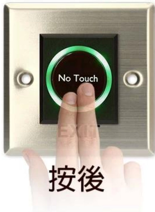
Green LED Indicator: Power ON (Triggered)