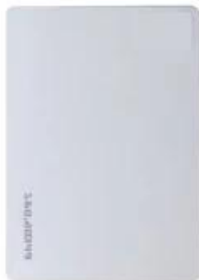
Master Add Card