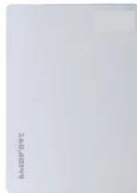
Master Delete Card