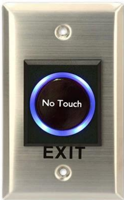
Red LED Indicator: Power ON (Triggered)