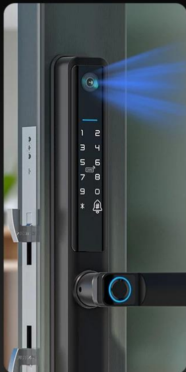
Door lock configuration camera