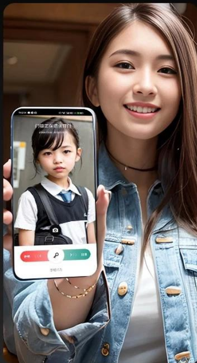
phones can see visitors